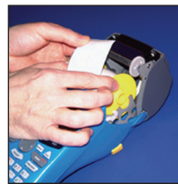
Drop the label roll into the printer