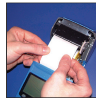
Pull the labels over the top (like loading film into a camera)